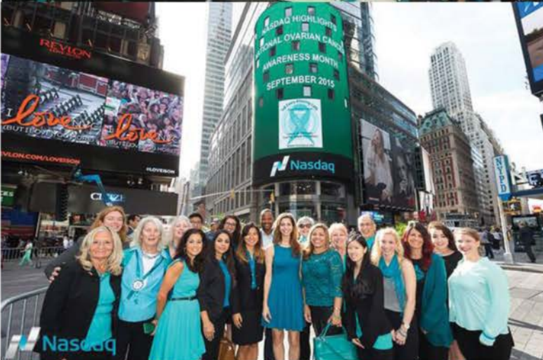
(Pictured above) T.E.A.L.® at the NASDAQ on 9/21/15

It is well known that bell ceremonies are seen by millions, and are the most watched events each day across the world.