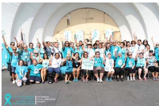
Survivors on stage during our annual Survivor Ceremony at the Brooklyn T.E.A.L.® Walk Run.